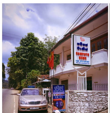
SAMPATH GEMS AND JEWELS KAHAWATTA