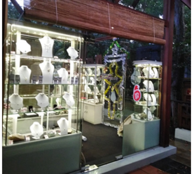
GEMLUCK AT GRAND UDAWALAWE SAFARI RESORT