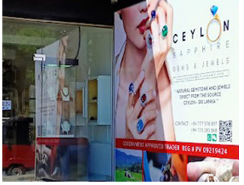
CEYLON SAPPHIRE GEMS AND JEWELS