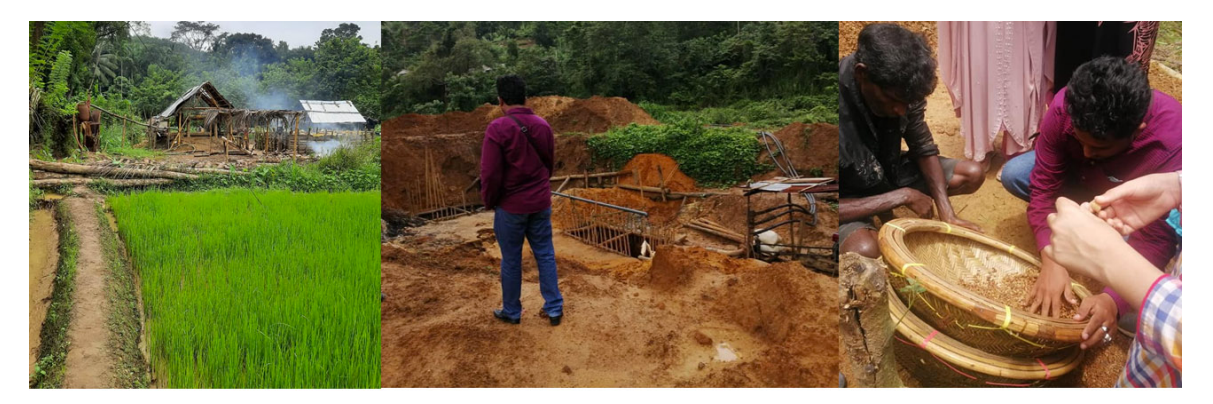
GEM MINING IN KAHAWATTA