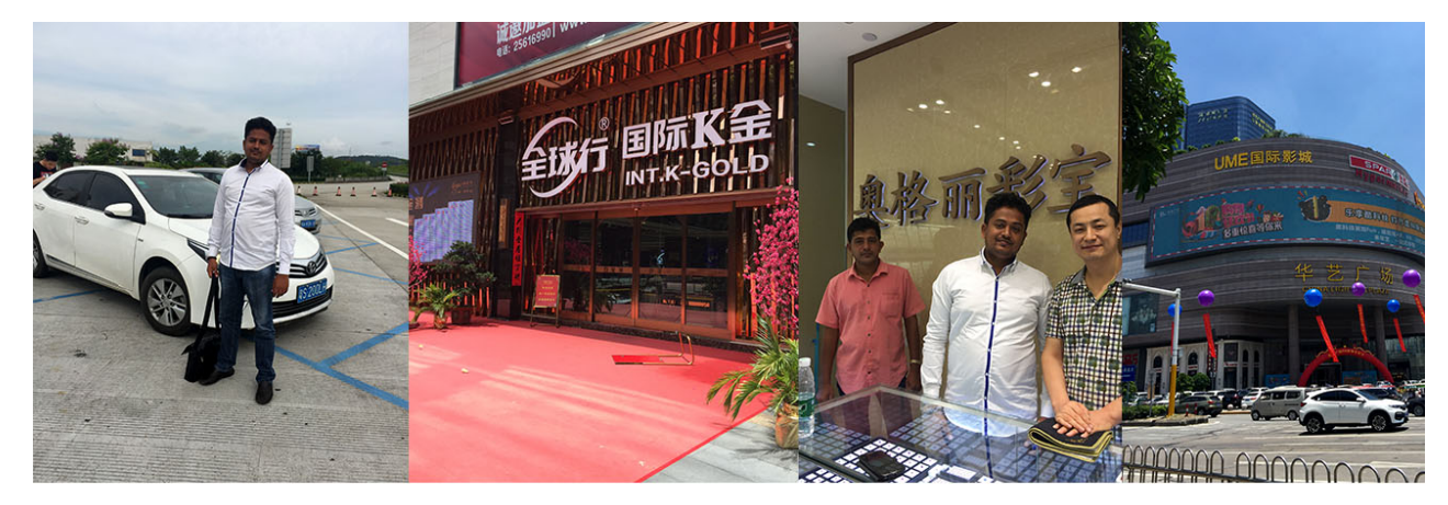
CHINA AND HONG KONG