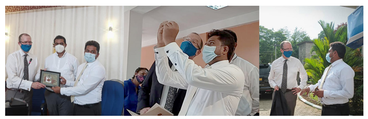
GEMCITY PROJECT DISCUSSION WITH CANADIAN AMBASSADOR